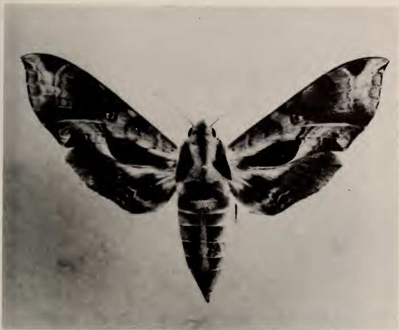
FIG. 1. Eumorpha intermdia ♀, 20 June 1979, Edgard, Louisiana.

1 specimen, E. satellitia rosea (Closs)—5 specimens, E. eacus (Cramer)—1 specimen, E. anchemola (Cramer)—50 specimens, E. triangulum (Rothschild & Jordan)—92 specimens.